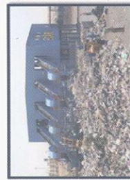
1. Receiving area and presorting

Due to the ever increasing need to reduce our dependency on fossil fuels, As power generating companies and other energy users look towards reducing reliance on coal, oil and gas, the challenge to find alternative fuel sources is hotly contested. We believe we have technology, technically and operational capability to produce high quality alternative solid waste.