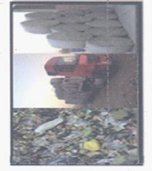
5. Raw reject, unshredded RDF, Fluff RDF