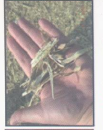
Shredded Cotton stalks