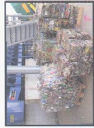
3. Baling of recyclables