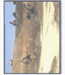
6. Landfilling of rejects