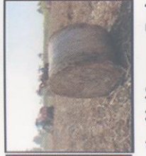
Shredded Sugarcane Trash Bales