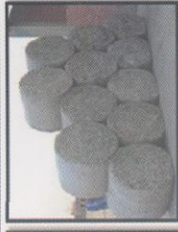
Fluff RDF Bales