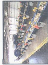
2. Sorting of solid waste