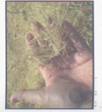
Shredded Rice straw